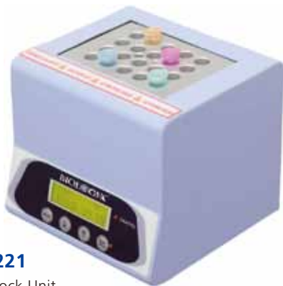
03-4221 One Block Unit