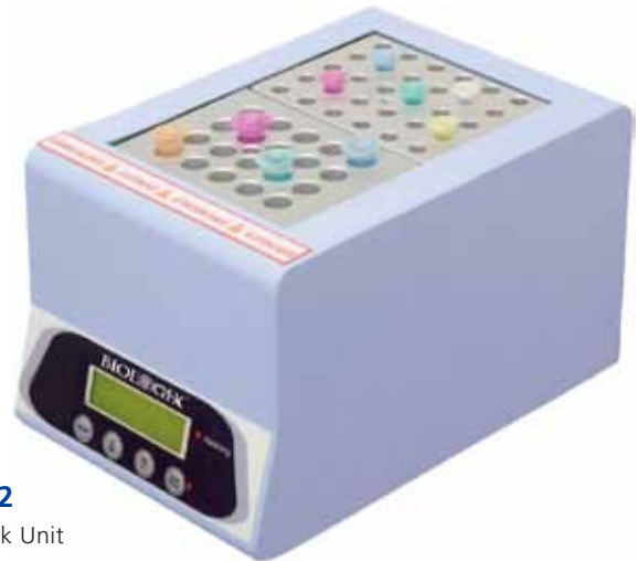
03-4222 Dual Block Unit